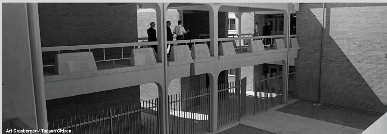
Art Grasberger / Tucson Citizen