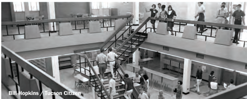
Bill Hopkins / Tucson Citizen