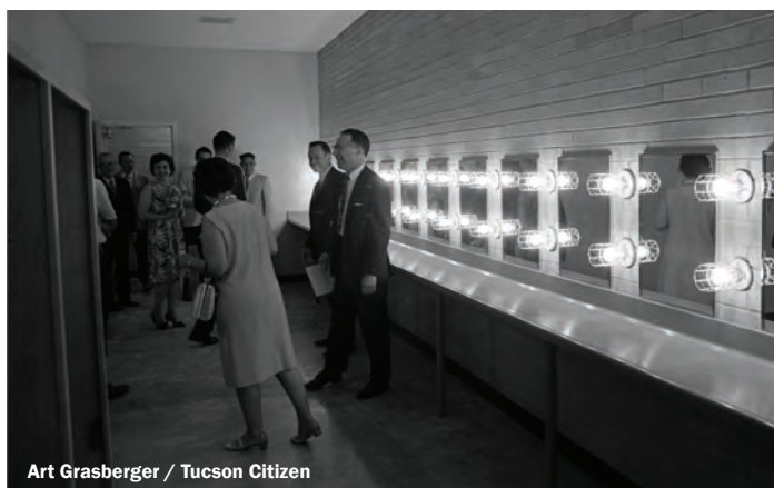
Art Grasberger / Tucson Citizen