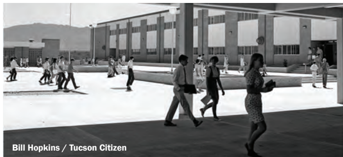
Bill Hopkins / Tucson Citizen